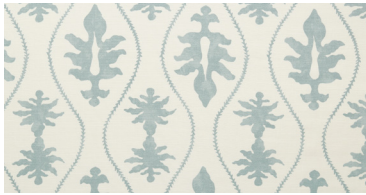
SEA GLASS 109-10-12-1-3

I was inspired by traditional Indian woodblock designs when creating Great Jones, a hand-drawn interpretation of the style. Great Jones can be used anywhere to add personality and vibrancy.