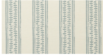
SEA GLASS 100-12-12-1-3

The delicate Astor Leaf reflects my love of traditional Indian woodblock prints, weaving a petite leaf motif between a stripe pattern. Like other designs of mine, watercolour techniques allow for a soft, mottled look- ideal for a decorative addition to a classic interior.